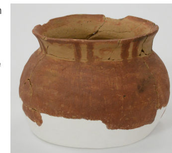
Red-painted Spherical Pot (Sekisai Kyudo Kame), 9th century, Teikyo University Collection

Excavations were conducted on the Teikyo campus up to 2017 at the Uwappara, Ryugamine and Otsukahinata sites. Many archaeological artifacts from the Paleolithic era through recent and modern times have been unearthed, contributing to the elucidation of the area's history. The excavated remains include pitfalls during the Jomon period for catching animals, pit dwellings, villages during the Tumulus period, tombs dug into the sides of the hill during the Nara period and part of a village during the Heian period. This exhibition presents TUM's collection chronologically, mainly focusing on the remains from Uwappara and Ryugamine sites. Of specific note is the Red-painted Spherical Pot (Sekisai Kyudo Kame) found in the Uwappara site that tells a story of the people taken to the Tama area from their original North Eastern Japan habitat.