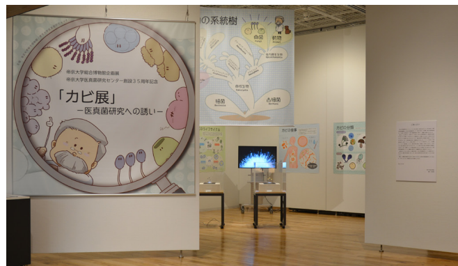
Upper: Molds – Invitation to Medical Mycology, the 35th Anniversary Exhibit of the Teikyo University Institute of Medical Mycology Left: Discoveries from On-Campus Archeological Remains “In search of mysteries of Emishi who lived in ancient Tama.”