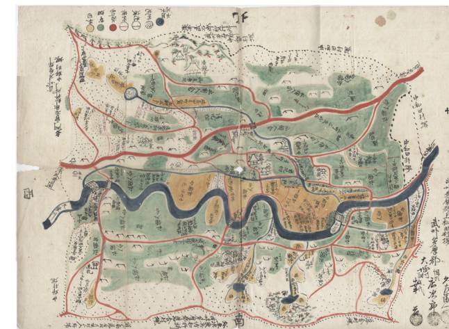
Graphic map of Otsuka village (private collection)